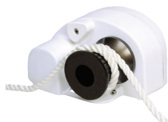
POWER 1000 Capstan