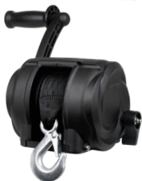
Premier Series 2000 Trailer Winch