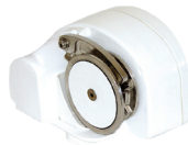
Windlass # P77736