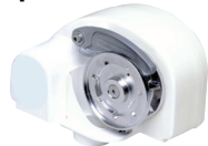
Windlass # P77727