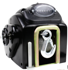
Remote Control RC30 Series Trailer Winch