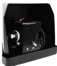
POWER Folding Camper Winch