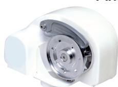
Anchor Winch 36' Class Windlass