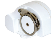
Windlass # P77746